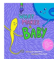
What Makes a Baby